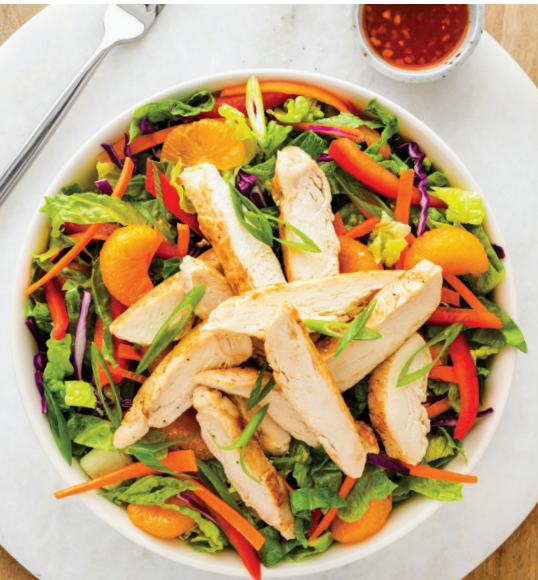
Asian Chicken Salad made with 80300 PERDUE® Oven Roasted, Fully Cooked Chicken Breast Strips

Ready-to-eat, chicken breast strips are an easy addition to salads, sandwiches, pitas, pizzas and more.