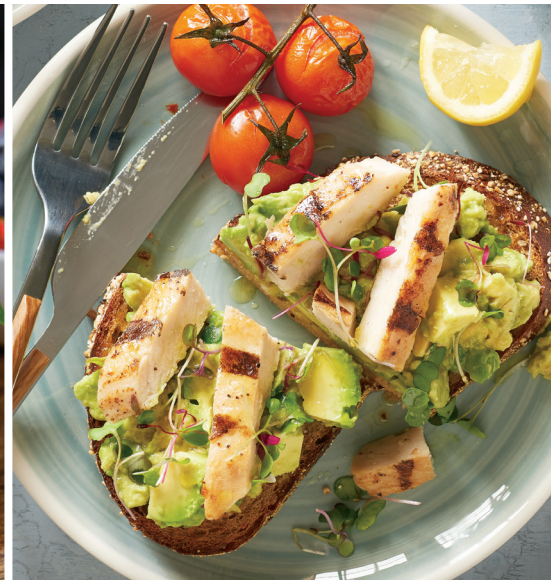
Avocado Toast & Chicken made with 7326 PERDUE® Grill Marked Chicken Breast Strips

Pre-sliced, gluten free, No Antibiotics Ever turkey in a resealable zipper bag is the fast, healthy option for every day part.