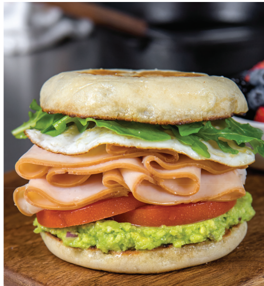
Breakfast Sandwich made with 75128 PERDUE® SANDWICH BUILDERS® Mesquite Smoked Sliced Turkey Breast

Ready-to-eat, chicken breast strips are an easy addition to salads, sandwiches, pitas, pizzas and more.