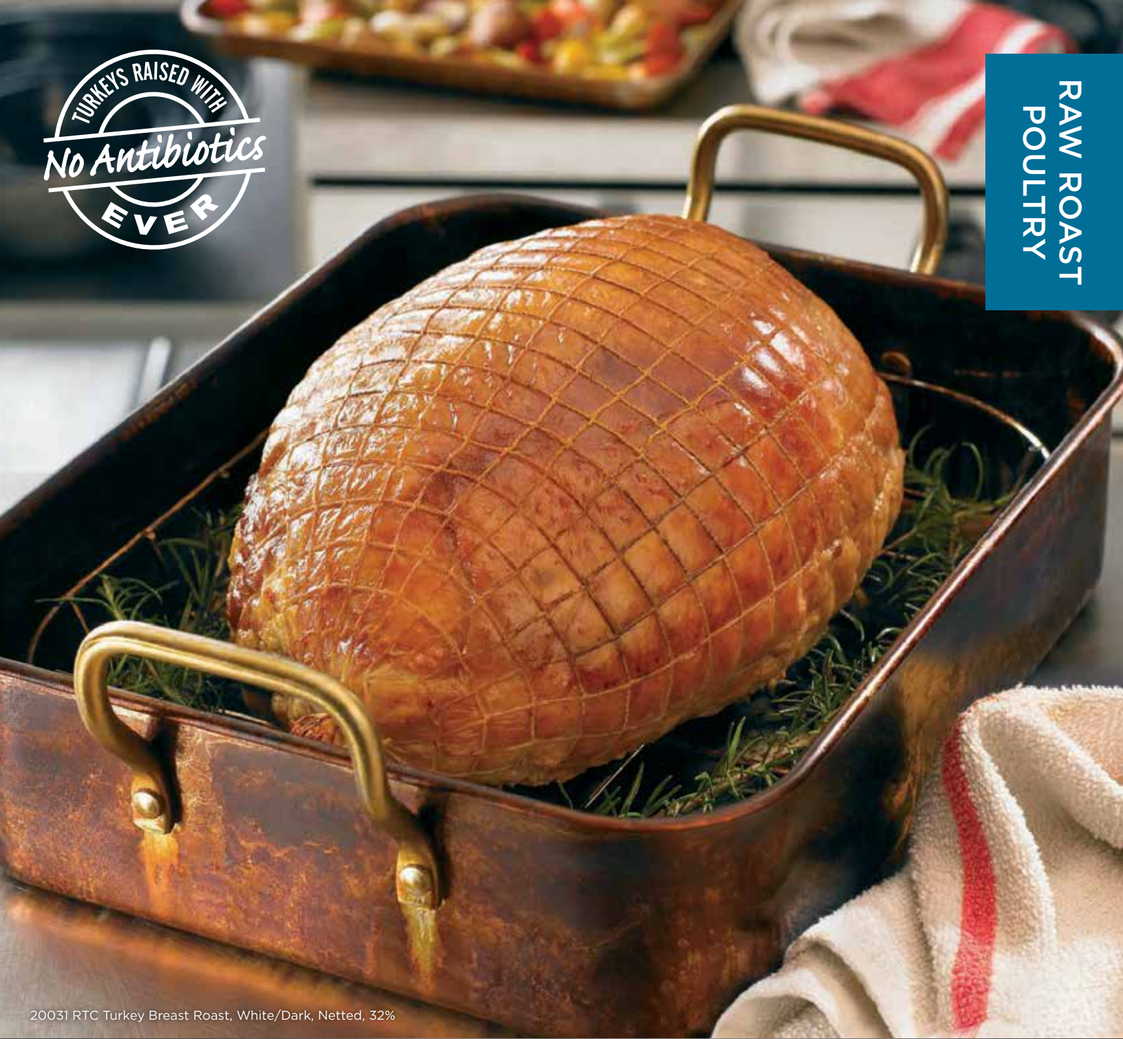
20031 RTC Turkey Breast Roast, White/Dark, Netted, 32%