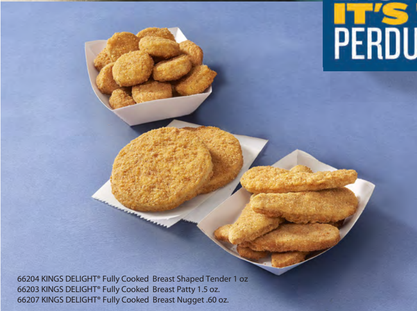
66204 KINGS DELIGHT® Fully Cooked Breast Shaped Tender 1 oz. 66203 KINGS DELIGHT® Fully Cooked Breast Patty 1.5 oz. 66207 KINGS DELIGHT® Fully Cooked Breast Nugget .60 oz.

IT'S NOT THE EASY WAY, IT'S THE PERDUE WAY