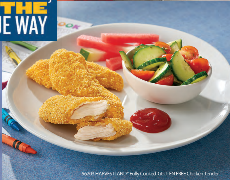
56203 HARVESTLAND® Fully Cooked GLUTEN FREE Chicken Tender