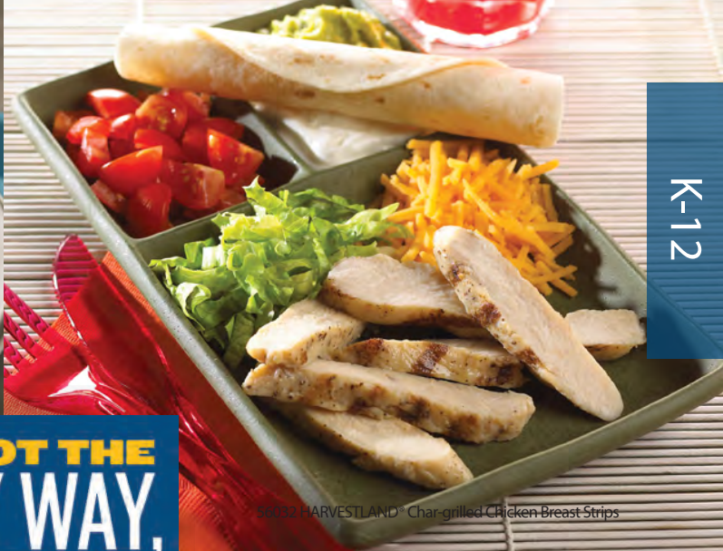
56202 HARVESTLAND® Char-grilled Chicken Breast Strips