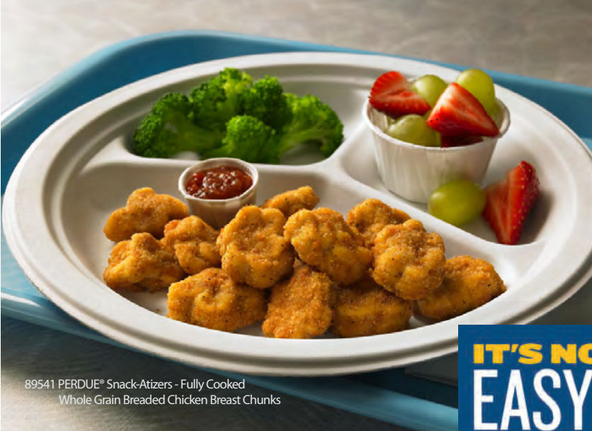
89541 PERDUE® Snack-Atizers - Fully Cooked Whole Grain Breaded Chicken Breast Chunks